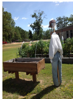
Atlanta Elementary School JMG Project