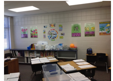
Atlanta Elementary School JMG Project Room