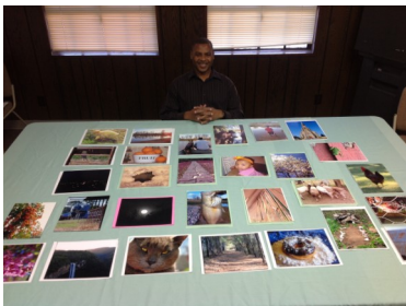
County Photography Contest 29 Entries