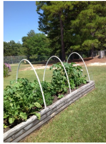
Atlanta Elementary School JMG