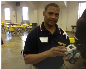
Gearing up for Robotics Project