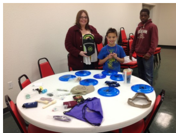
4-H'er and Volunteer checking out the Door Prizes