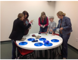
4-H Leaders Lending their advice