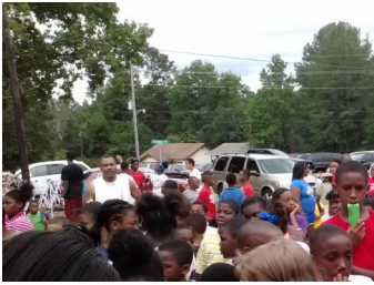
ONE INC Day in the Park Back to School Event