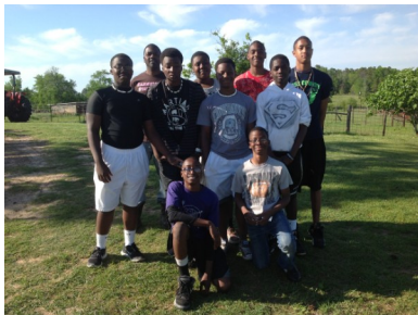
Douglassville 4-H Club