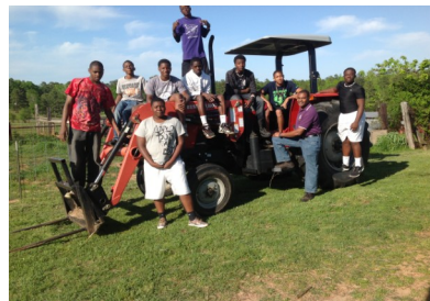
JMG Project Group Douglassville 4-H Club