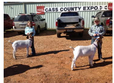
Hope 4-H Club Members getting ready for County Livestock Show